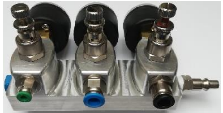
Air Control Manifold (tripe valve unit). Designed for mounting on a belt or wait Band.