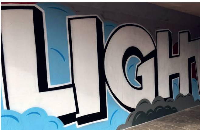
Graffiti Protection for Good Graffiti