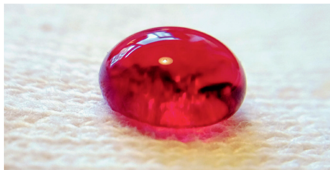
Fabrics coated with HNSFT technology after 15 wash cycles.

This chart shows the performance of standard commercially applied fabric coatings. The maximum oleophobic rating after 10 washes is only 5.