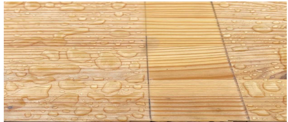
Protection against moisture (hydrophobic)