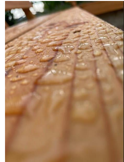
Water beads up