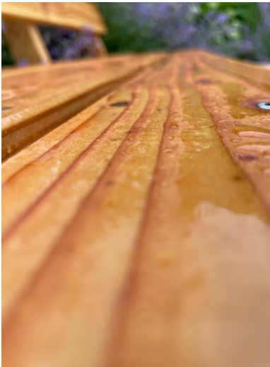
Water soaks into the wood